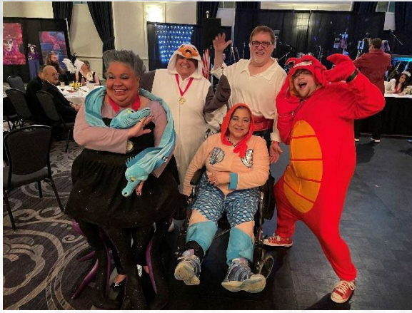
Even the ICC President was in costume with the Alioto Family